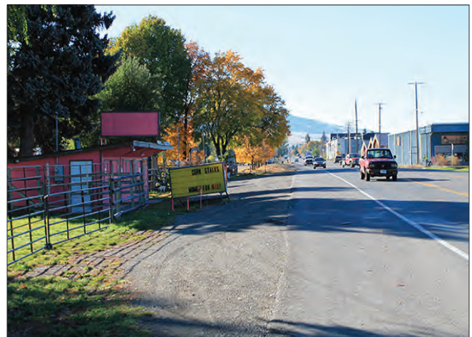
many buildings have a finished floor elevation below Russell Street