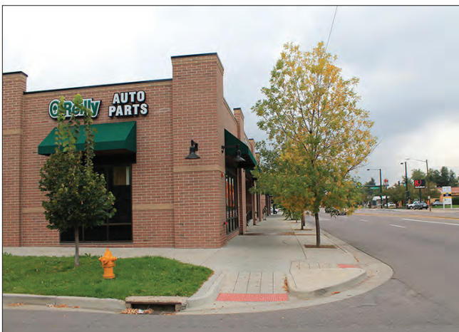
example of an auto-oriented use fronting a Denver street and utilizing aesthetically pleasing materials