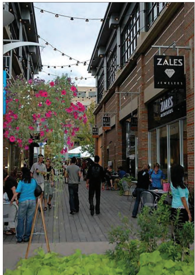
a pedestrian walkway (paseo) between buildings to access parking lots can also include business entrances as in Lakewood, Colorado

Most importantly, the existing regulations should be revised to embrace a wider range of pedestrian-friendly treatments and features, allowing developers more flexibility to select those that fit their design, budget, and project needs. This will result in more variation of treatments and outcomes, which further enhances pedestrian appeal. An example approach is indicated on the following page (listed pedestrian friendly features and quantities are illustrative, not exhaustive).