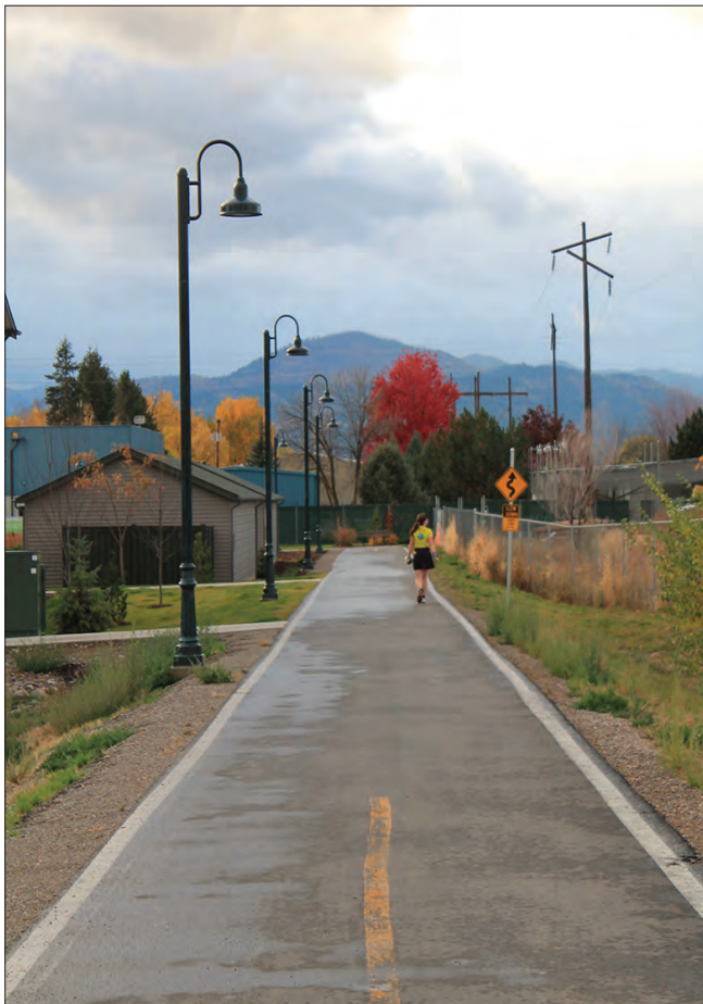
provide “regulatory points” to developments that provide access point to the Milwaukee Trail

As the area continues to redevelop, the properties along River Road should be redesigned to allow for public access to the river. The portion of the