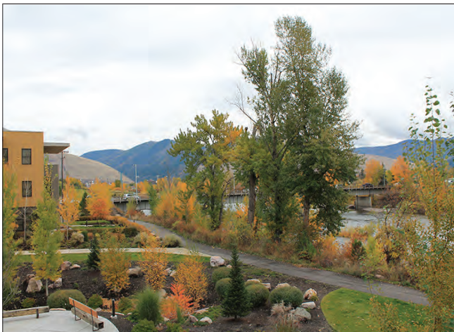
new development should provide access to the Clark Fork River such as the Equinox and Solstice project