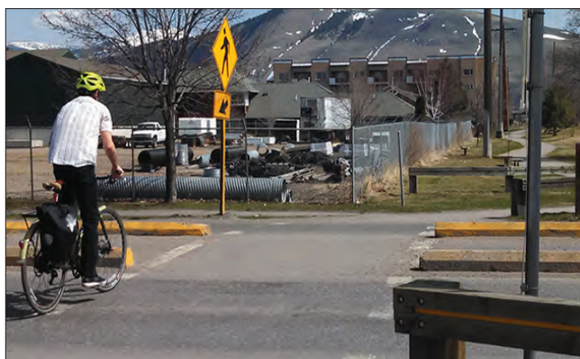
Missoula has robust bicycle use