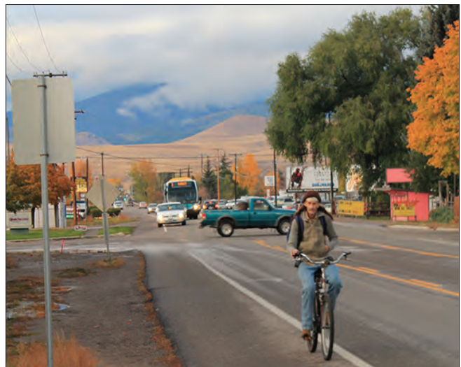
cyclist utilizing Russell Street

NMW is an initiative administered by the Sonoran Institute, a non-profit organization that inspires and enables community decisions and public policies that respect the land and people of western North America. Information about the New Mobility West technical assistance program can be found at: www.newmobilitywest.org/community-assistance .