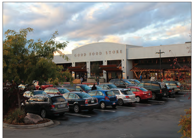
Good Food Store is a popular destination in the study area