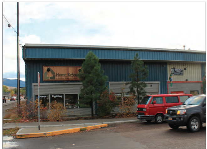
existing neighborhood compatible artisan/light industrial uses

One challenge for some of the desired use types – including locally owned, entrepreneurial, neighborhood serving businesses – is that affordable, quality tenant space is difficult to find. Many Russell Street properties are older and underdeveloped, and as such are better configured for redevelopment, rather than reuse. Business entrepreneurs often lack the means or the experience to redevelop a parcel and instead look for existing space to fill. However, as developers redevelop the properties, the cost of newly developed commercial tenant space can be prohibitive to local and start-up businesses. The MRA could partner with a private developer to redevelop a site on Russell Street and either retain control of or place covenant on one or more tenant spaces restricting them to uses approved by MRA. These spaces could be offered at below-market lease rates to neighborhood-serving uses that fit the community vision and help establish the desired character, with the hope that they may also help attract other such uses to the area.