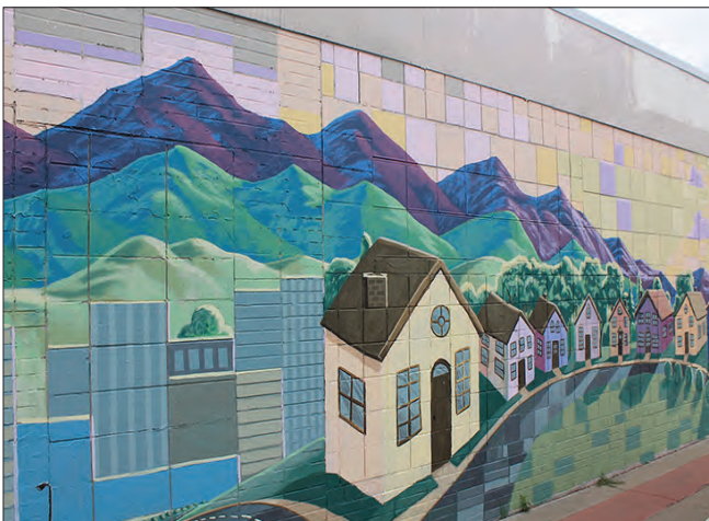
Denver example of bright hues that add artistic appeal

The City and MRA could jointly develop design standards that would be non-binding guidelines at the City but required for MRA financial participation or support. Developers indicate that expedited permit