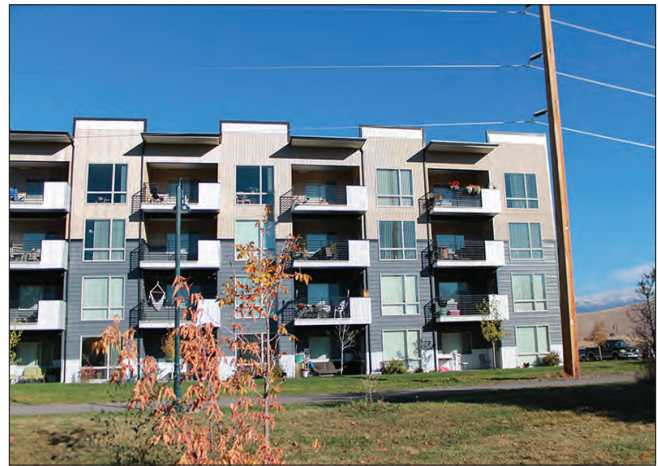
existing new development in Russell Street area

While some redevelopment is already starting to occur, it is expected that the significant investment in the reconstruction of Russell Street will catalyze transformation of the northern part of Russell Street. In addition adjacent areas of West Broadway may redevelop as this area has been in a holding pattern waiting to capitalize on the improvements to Russell Street.