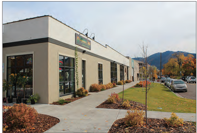
Spruce Street Plaza is a great precedent of a desired type of development in the Russell Street area