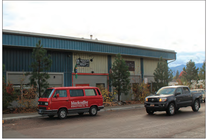
Black Coffee Roasters on Russell and Wyoming Streets is an example of an artisan manufacturing use

The relatively low land cost in the study area coupled with a great location and zoning that allows for a wide range and mix of land uses are attractive for artisan manufacturers. The niche could help develop an emerging hipster character for the Russell Street which could be promoted and developed through flexible zoning, and an emphasis on design. Artisan Manufacturing uses with ancillary retail is a good fit with the preferences and spending patterns of the psychographic segments currently in the PMA and likely to be attracted to new market-rate rental housing units. The depth of demand for this land use is somewhat unclear without further analysis. The Spruce Street Plaza and 806 West Spruce in Missoula also represents an example of this type of niche. These appear to be fully leased and are surrounded by other stable uses that may limit expansion of this niche.