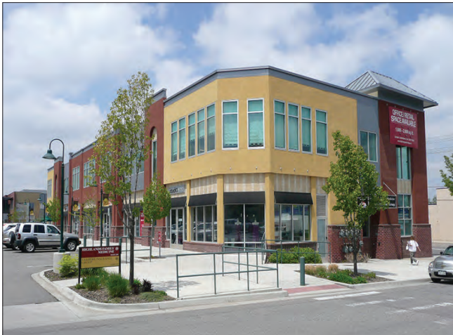
parking at the side or rear of buildings is desired as illustrated in the Denver example

The existing regulations require that parking be located in the rear or side unless required parking cannot be accommodated in these locations. However, parking cannot be accommodated within a 40-foot setback. P.U.M.A. recommends that the primary intent of the parking provision should be reinforced by reducing the maximum allowed front setback maximum to 20 feet, which in conjunction with the revision to the landscaping requirement would be adequate to allow for desirable seating, plazas, entrances, and similar. In cases where parking cannot be accommodated to the side or rear, a discretionary approval process would be necessary to approve an alternative site configuration – as it currently is because the 40-foot depth is unworkable.