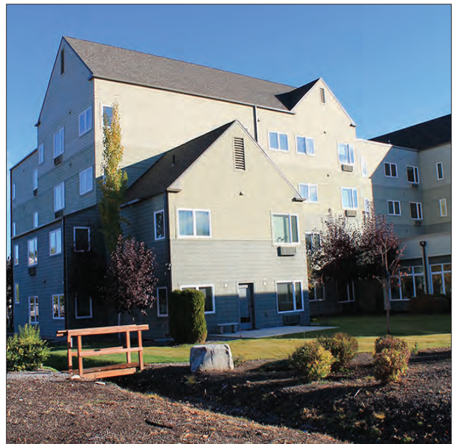
existing senior housing in the Russell Street area

The current market cycle is very strong for market-rate moderate and up-scale residential rental unit housing development. With low (5 percent) vacancy rates and proximity to both the University and Downtown, the Russell Street area is clearly a desirable place to reside. The multi-