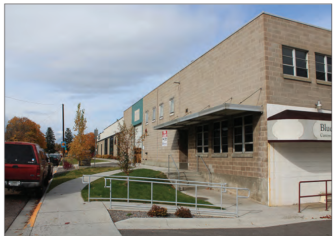
Blue Dog Custom Furniture is an example of existing light manufacturing in Missoula that could work near Russell Street