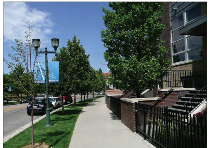
ground floor residences should have stoops so front doors are not directly on Russell Street as in this Denver example