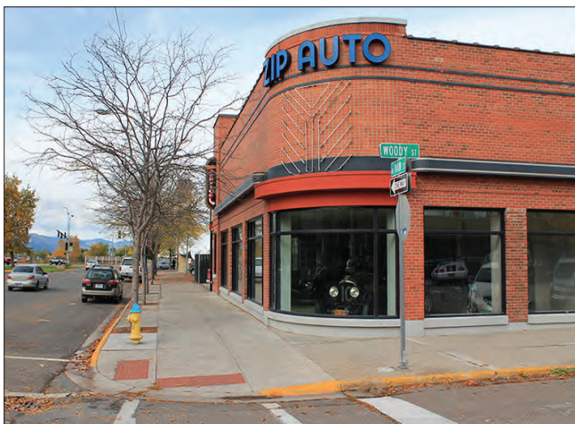
Zip Auto in downtown Missoula is a good example of a pedestrian friendly auto-oriented use with ample transparency to the street

All of the above must be weighed by the City, MRA, and community in determining how to address the community’s strong desire for attractive buildings along Russell Street. The recommendations for design standards below represent two possible approaches that could be taken singly or combined.