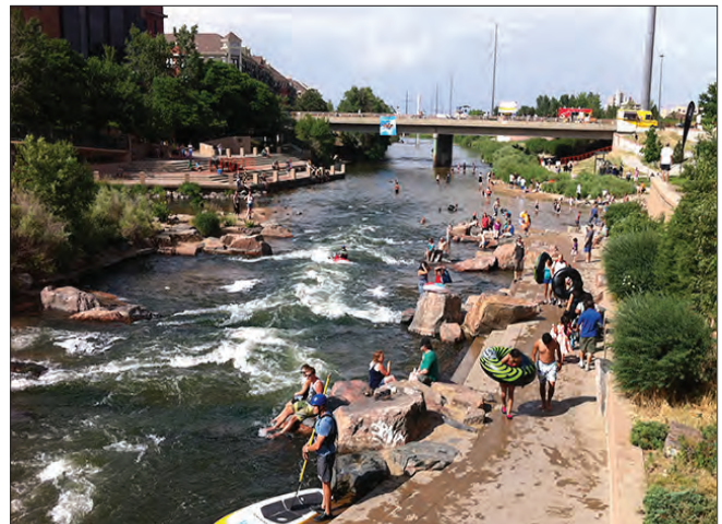
engage the riverfront and provide pedestrian/bike access as along the S. Platte River in Denver