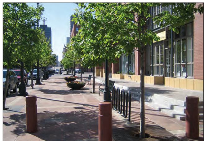
building setbacks such as this example in Denver that provide usable space for pedestrians should count toward landscaping requirements

Allow a wider range of treatments for parking lot buffering and landscaping along Russell Street and adjacent side streets including artistic fencing treatments that use quality materials; intensive landscaping that incorporates a 50-100% more plant materials than standard requirements, and the use of natural features such as berms, boulders and grade separation. The use of alternatives could either be allowed for any parcel in the overlay or as an incentive granted for the provision of extra pedestrian enhancements. Allowing creative and artistic buffer treatments could contribute to a creative, authentic, slightly edgy character for Russell that sets it apart from other, more landscaped