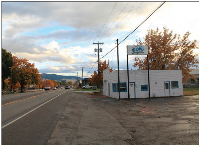
the community desires aesthetic improvements to the corridor