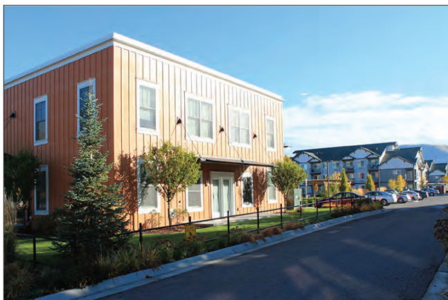
existing housing types west of Russell Street

Under current market, infrastructure and regulatory conditions, a realistic outcome could be that some of these parcels would redevelop in exclusively residential multifamily land use. With the street reconfiguration, streetscape enhancements will improve the attractiveness of Russell which could make nearby parcels even more appealing as residential sites.