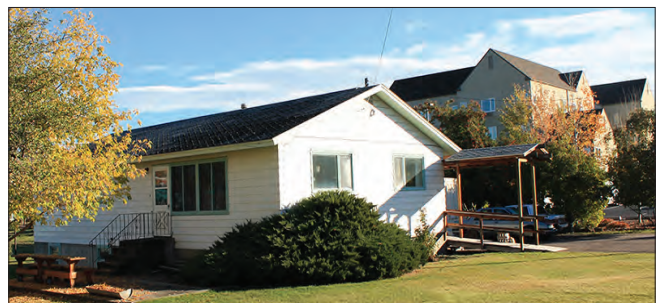
a variety of housing types exist in the study area