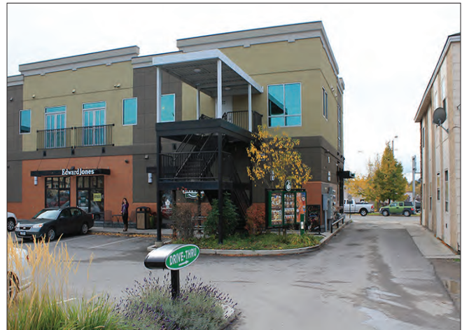
the City Brew drive-thru in downtown Missoula is an example that is accessed from the sides street and rear of the building