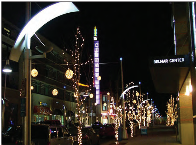
an example of unique pedestrian friendly lighting in Lakewood, CO that has full cut-off to prevent light trespass and conform with dark sky standards