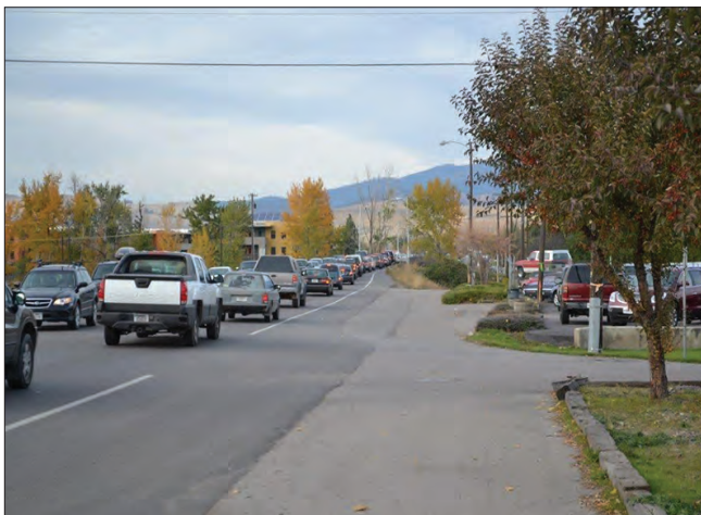
existing peak hour traffic on Russell Street

Some businesses in and near the Russell Street study area are themselves destinations, most notably The Good Food Store and The Source fitness center and to a lesser extent, Bayern Brewery, Home Resource, the Pink Grizzly, and Black Coffee Roasting (although the latter has recently relocated to Spruce Street). Destination businesses anchor other retailers and can offer attractive synergies to those that seek a similar customer. The typical natural grocer customer -- educated and relatively affluent -- is an attractive customer for many retailers. Grocery customers typically arrive by car in order to transport a large grocery purchase, and would typically be able to transport additional purchases, including bulky goods, in the same trip. Destination retailers such as home furnishings, general merchandise, garden supplies, appliance stores, and similar would potentially be interested in a location nearby The Good Food Store.