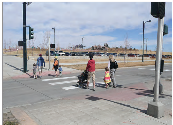
this pedestrian activated signal in Denver greatly improves the crossing safety of a four lane road