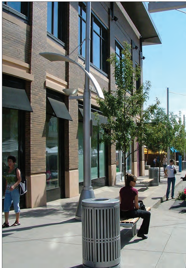
pedestrian-friendly design is highly desired in the study area such as this new streetscape in Lakewood, Colorado

to be attracted to the corridor once the street reconfiguration is complete and their standard designs will likely not contribute to the envisioned character. The anticipated public investment in the street reconfiguration of nearly $7-10 million per block is a platform from which it is imminently reasonable to expect the private sector to partner in making a pedestrian friendly character. Current standards allow for a range of outcomes including some that do not meet the community's expectations. The existing design standards are few, and allow for materials, colors, and uninteresting buildings that are not acceptable to the public.