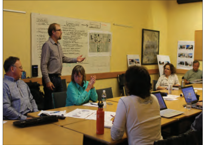
work session with MRA and City staff