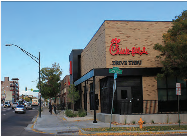
a well-designed auto-oriented franchise with a drive-thru in the rear accomplished through Denver's "Main Street" zoning