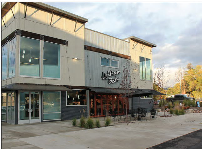
The Source is a new cafe and gym in the study area