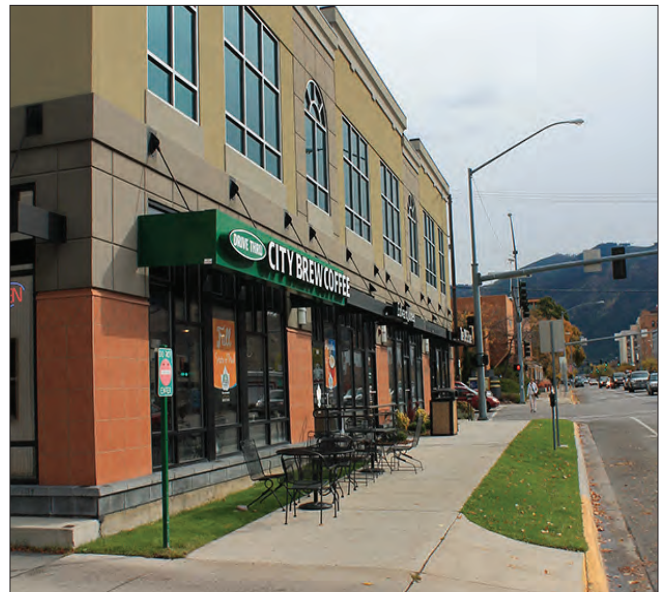
City Brew/UPS building on Broadway is a good pedestrian friendly example with street entrances and good building transparency and outdoor cafe seating