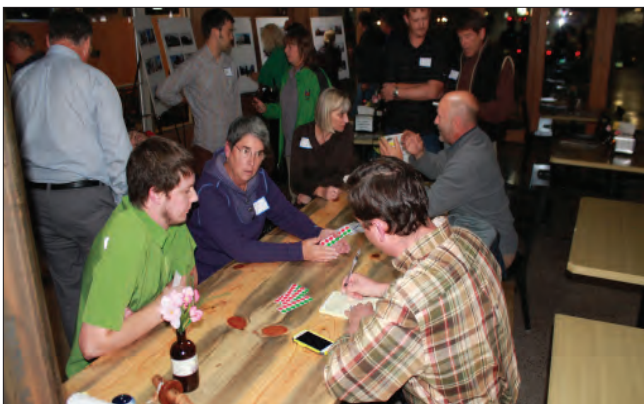
community meeting break out discussion at The Source

Three opportunities were provided to the citizens of Missoula to listen to P.U.M.A.'s presentation and provide input on what the vision should be for the Russell Street Area. The meetings were publicized through local print media, on-line, radio, and television. In addition, Russell Study area residents and property owners were given individual notice by mail. The first public meeting was held at The Source the evening of Wednesday October 22. After a brief presentation by the consultant team and short question and answers session, break out groups were formed for more detailed discussions. On Thursday October 23, a public open house was held during the lunch hour at the MRA and another evening public meeting was held at The Source for additional input. Below and on the following pages is a summary of these three meetings.