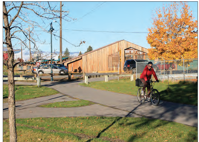
the Milwaukee Trail is a major attraction in the study area