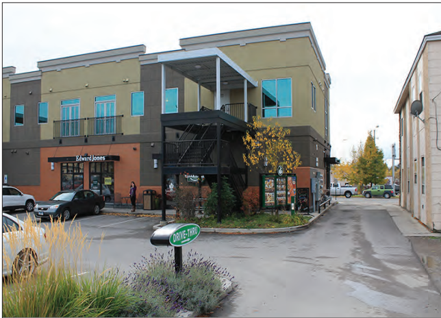
The City Brew drive-thru in Missoula is a good example of how a drive-thru can work in a mixed use building that fronts the street

The neighborhood surrounding Russell Street between Third and Broadway Streets should become a mixed use neighborhood that provides a unique sense of place in Missoula. Transportation choices should be maximized that include automobiles, transit, bicycles, and walking. A variety of neighborhood oriented services should be encouraged to locate here.