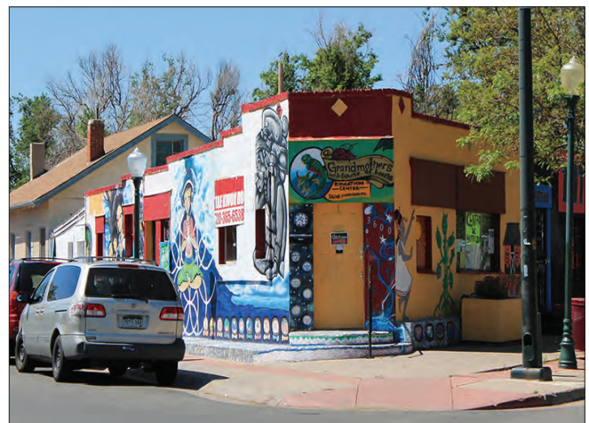
Denver example of bright hues that add artistic appeal