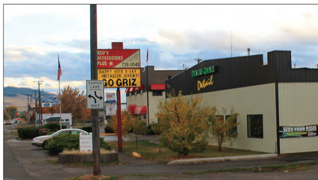
several businesses on Russell Street have parking that backs onto Russell Street which is unsafe for pedestrians and cyclists

In order to connect Russell Street to the neighborhood and because it influences the character on Russell, design standards as suggested in the recommendations above should apply to side streets within one block of Russell; along the Milwaukee Trail, and Wyoming Street all the way east to the Sawmill site.