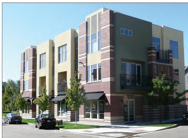
ground floors should be designed for commercial uses but could be residential uses in the interim such as this Boulder example

Street and other noise is a realistic concern for any residences facing Russell Street, and will potentially increase after the reconfiguration as traffic congestion eases and thus speeds increase. If residential will continue to be allowed fronting Russell Street, whether on lower or upper floors, noise mitigations may be appropriate. The overlay regulations could require noise mitigations for residential units facing onto Russell, such as extra-