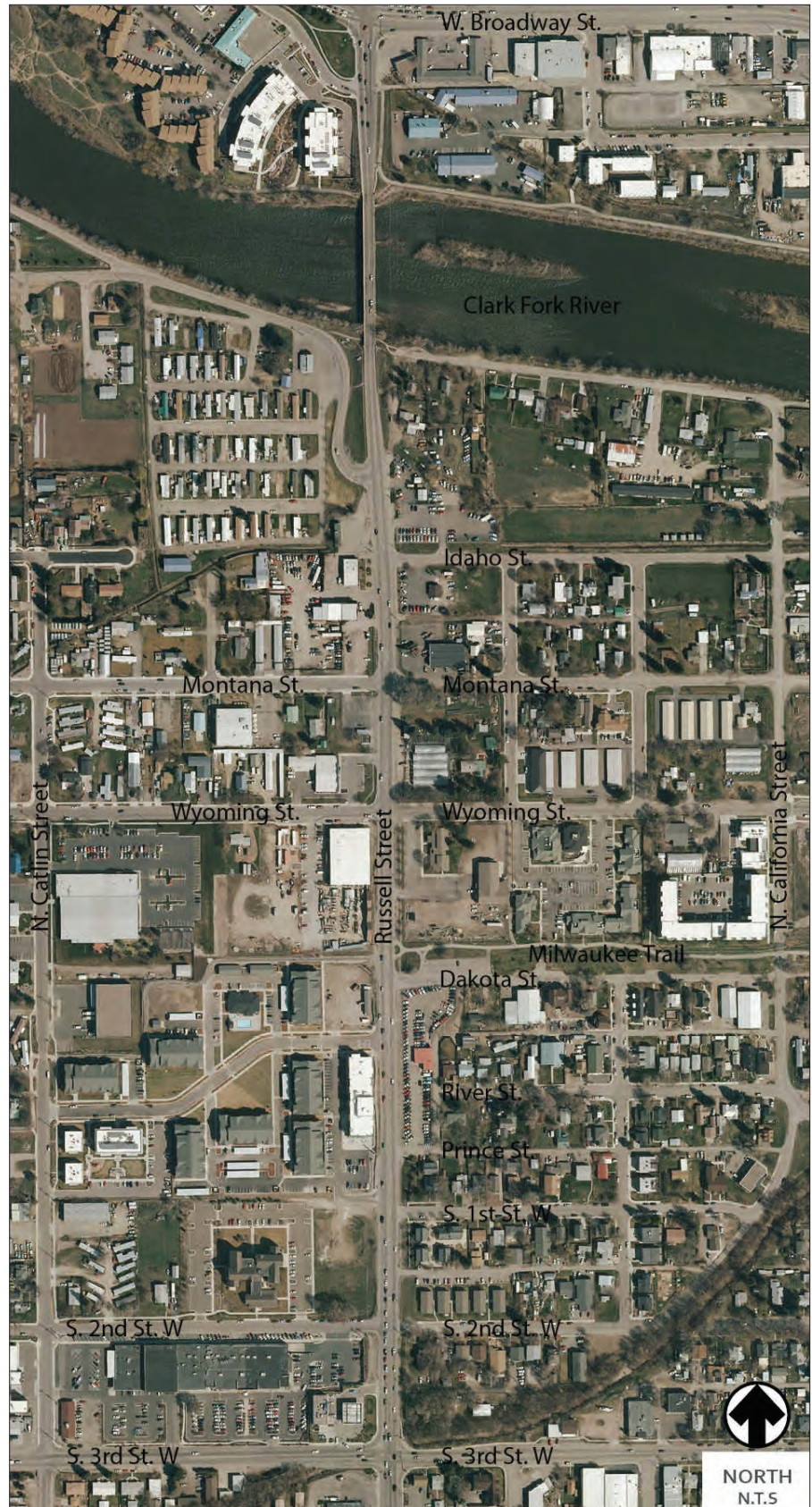
project study area

The primary purpose of this document is to develop recommendations for MRA policy and City regulations that will help realize the character anticipated by the future Russell Street cross section. The study area as illustrated is bounded by South 3rd Street, North Catlin Street, North California Street, and Broadway Street.