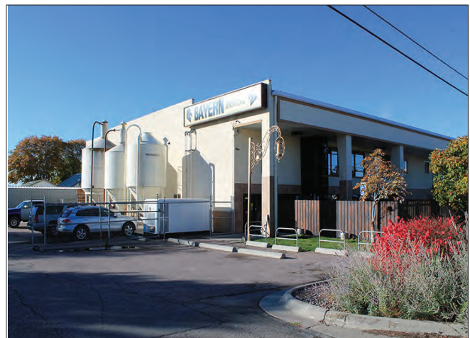
encourage Bayern Brewery to remove the privacy fence to create a more pedestrian inviting beer garden